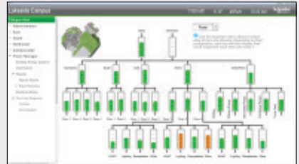
Electrical Network Health Summary