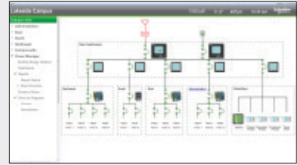
Electrical One Line Diagram